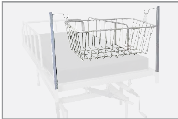
On Bed Cradle